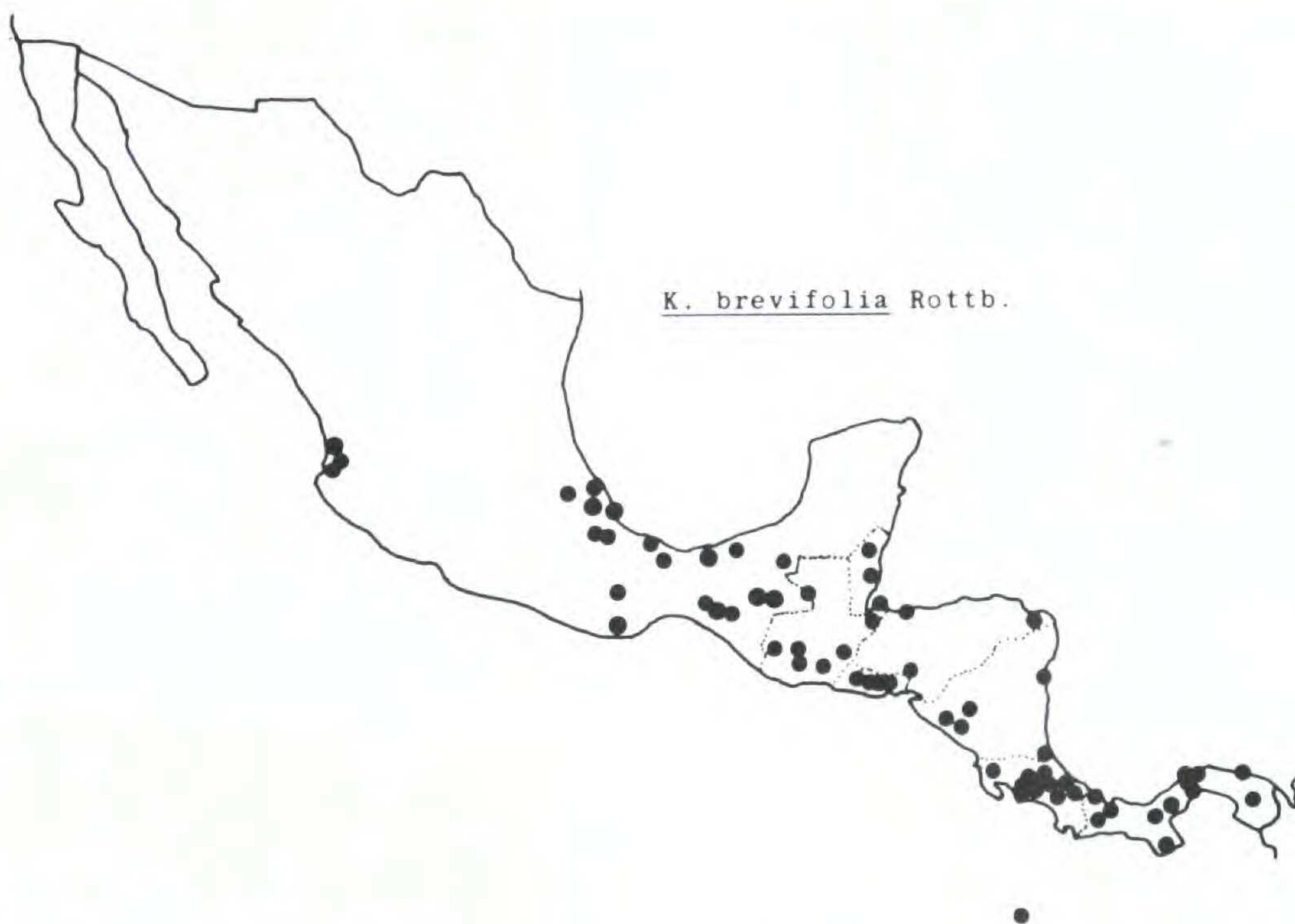
Figure 3. Distribution of K. brevifolia in Mexico and Central America.

and western Mexico south through Central America and the West Indies to Brazil and Argentina. Roadsides, pastures, ditches, marshes and streambanks, from sea level to about 2500 m.